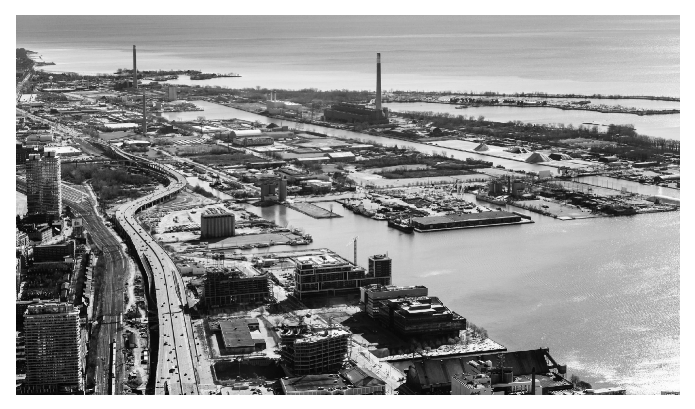
Figure 1: Toronto Eastern Waterfront Aerial View 2018.

cause of how certain algorithms and machines organize urban bodies over time. If, according to Foucault, the city is a social construction of everyday life, then how does the Operational City reflect that? In a smart city, the algorithm effectively acts as the state—in that the state functions autonomously and is thus no longer subject to the will of its citizens.